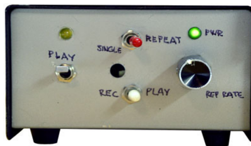
The end result.

I dealt with the intermittent trimmers by getting rid of them. I haywired the QRZ board to my mic and radio, determined the necessary value for each trimmer, then replaced it with