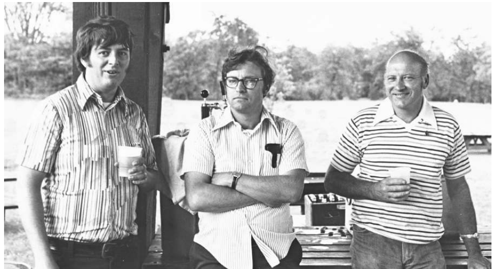
Here are three long-time club members, pictured on Field Day in the 1970's. Do you recognize anyone?