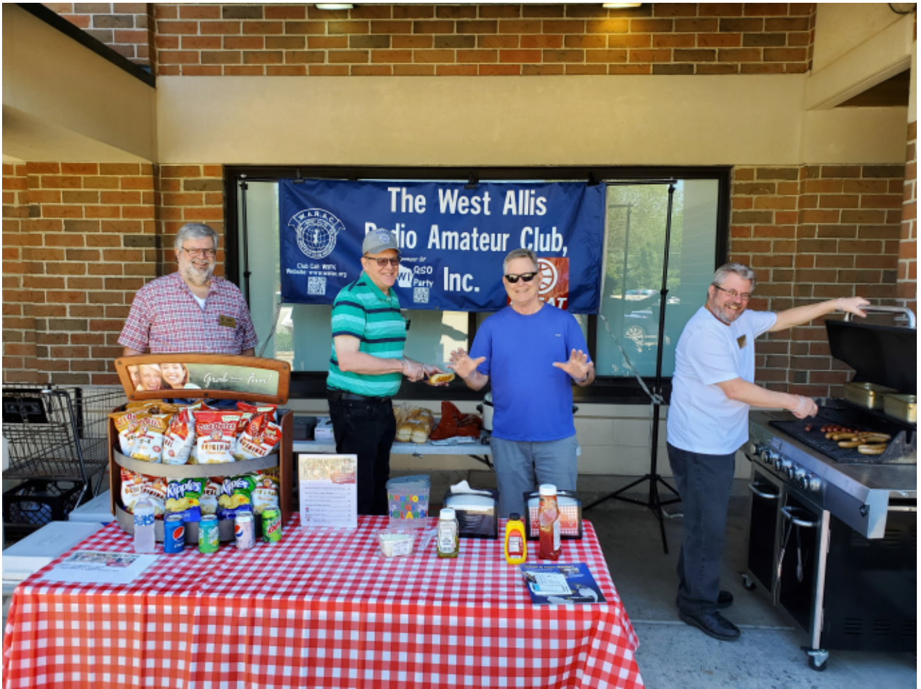
Sendik's fund raiser get together.